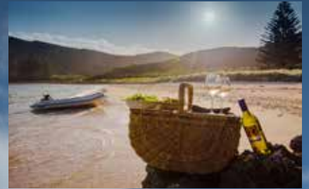
BILL'S TOP TEN THINGS TO DO ON LORD HOWE ISLAND