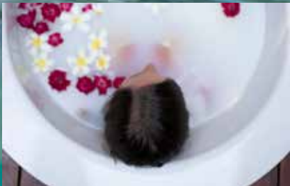
WELLNESS DAY SPA CREATING BALANCE WITHIN THE BODY