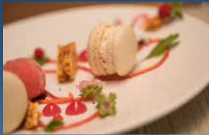
ARAJILLA RESTAURANT TANTALISE YOUR TASTE BUDS