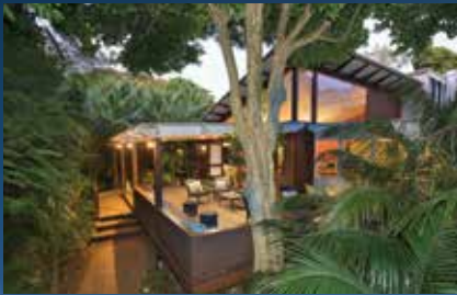
ABOUT ARAJILLA THE SHEAD FAMILY STORY