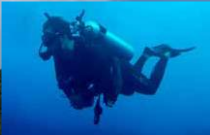
DIVING IN PARADISE SPECTACULAR CRYSTAL CLEAR WATERS