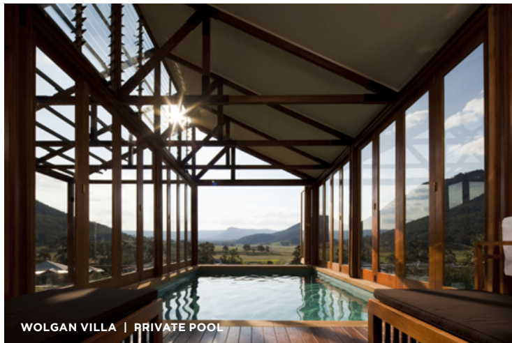
WOLGAN VILLA | PRIVATE POOL