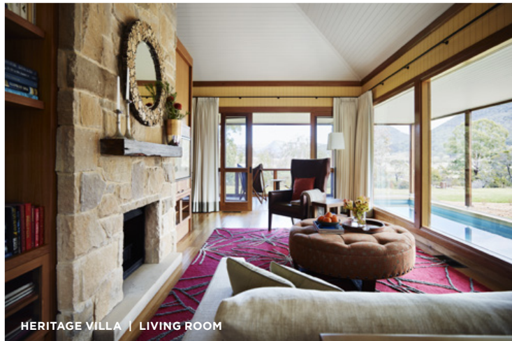
HERITAGE VILLA | LIVING ROOM